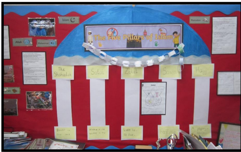
Class 2 have been learning about other world religions