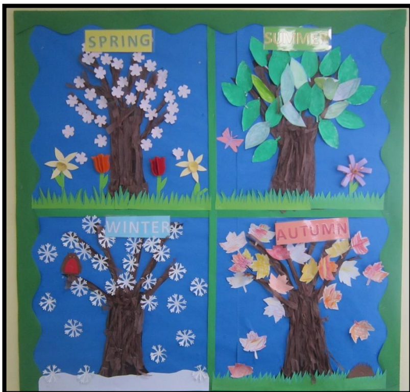
Class 1 thinking of seasons