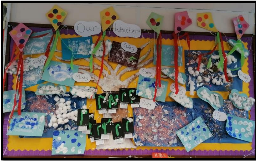
Preschool displays learning about weather