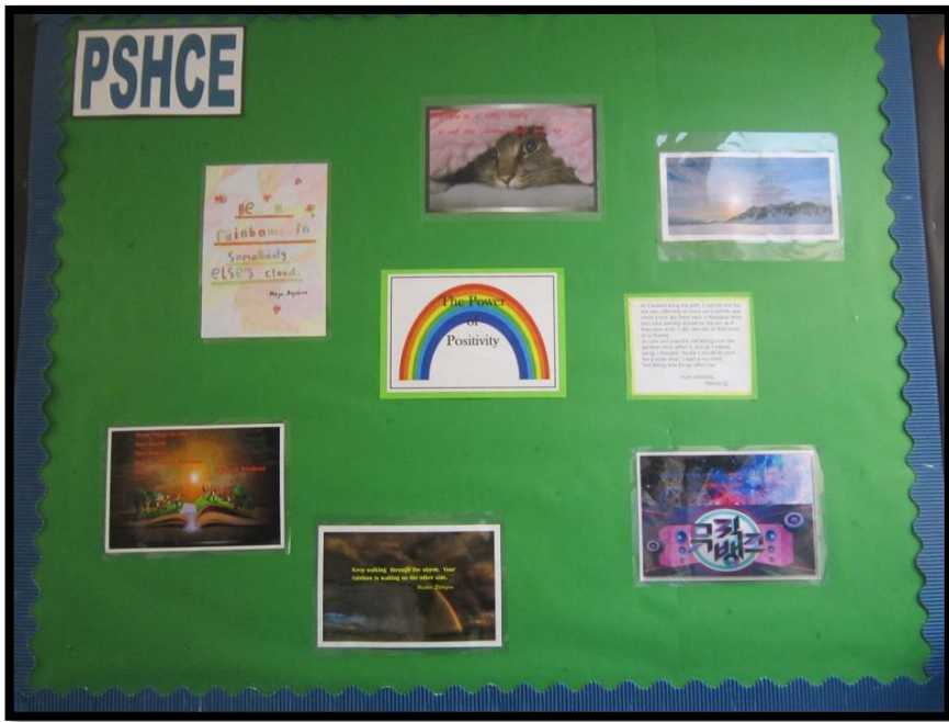
Class 3 thinking about positivity